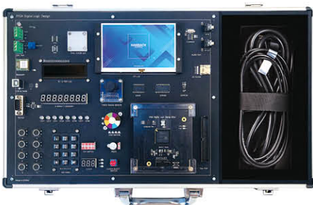
FPGA Digital Logic Design