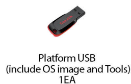
Platform USB (include OS image and Tools) 1EA